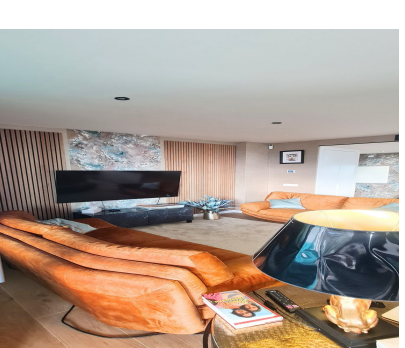
Ref.-ID: R4897504 Fuengirola