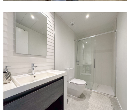
Ref.-ID: R4901365 La Cala de Mijas