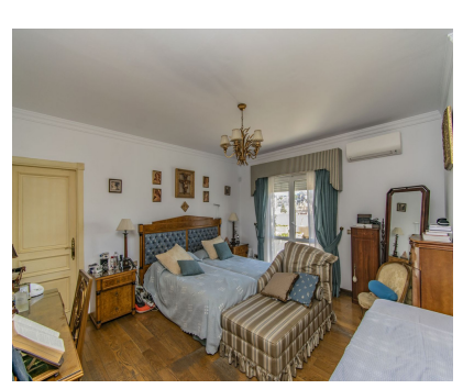
Ref.-ID: R4930066 Marbella Apartment