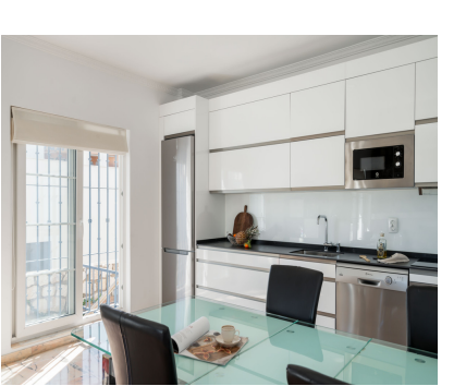
Ref.-ID: R4951639 Fuengirola