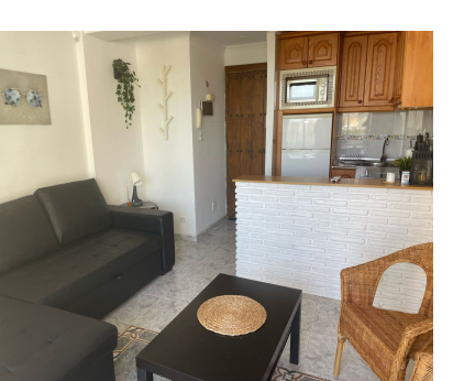
Ref.-ID: R4974322 Mijas Costa

Community: 696 EUR / year IBI: 200 EUR / year