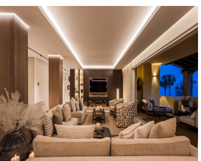
Ref.-ID: R4991338 Marbella Apartment