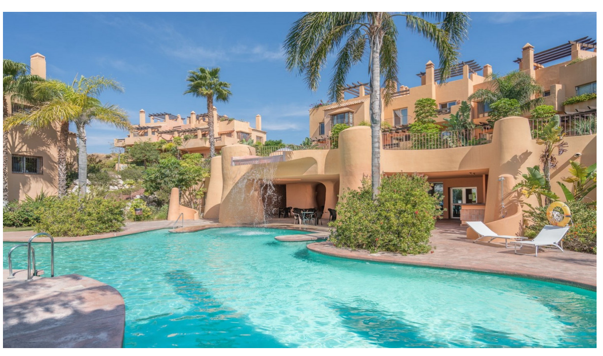
Riviera del Sol