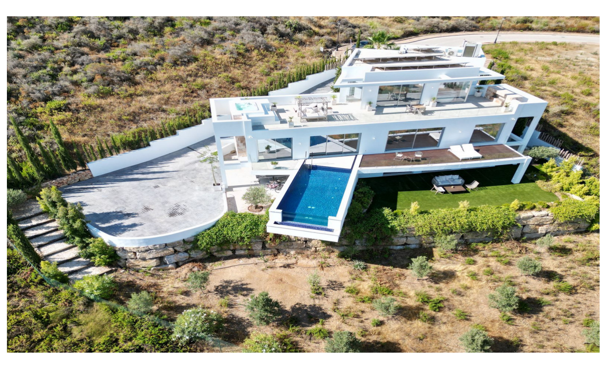
La Cala de Mijas