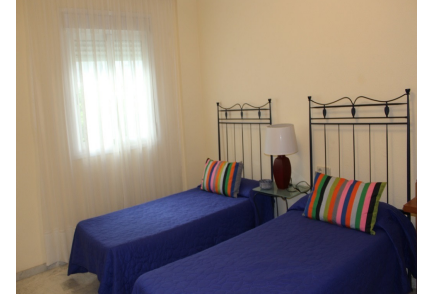
Ref.-ID: R3018668 Marbella Apartment