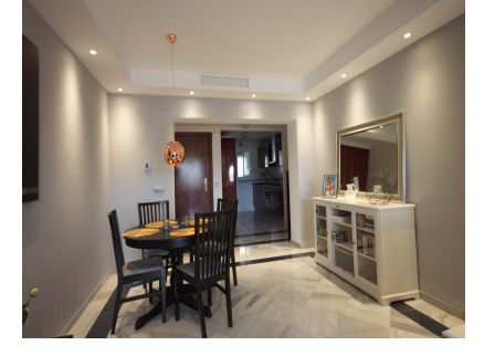
Ref.-ID: R3470596 Nueva Andalucía Apartment