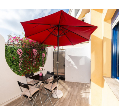
Puerto de Cabopino