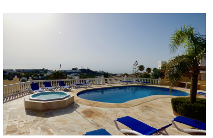
Ref.-ID: 26 Riviera del Sol