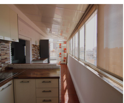
Ref.-ID: R4438165 Fuengirola