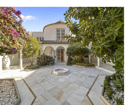
Ref.-ID: R4574413 Benalmadena Pueblo