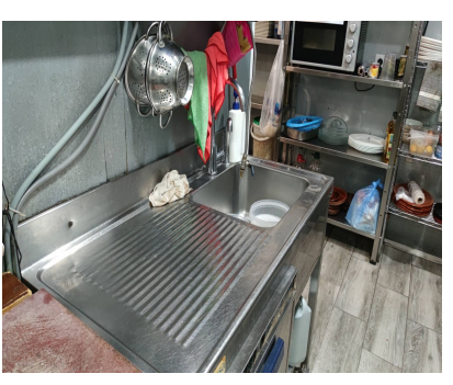
Ref.-ID: R4683979 Benalmadena Коммерческая