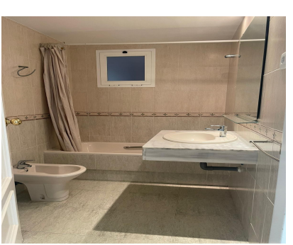
Ref.-ID: R4694860 Torremolinos Апартамент