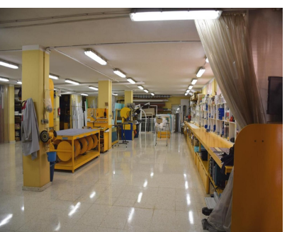
Ref.-ID: R4741111 Mijas Costa Коммерческая