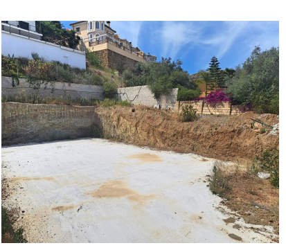
Ref.-ID: R4742560 Coín Участок