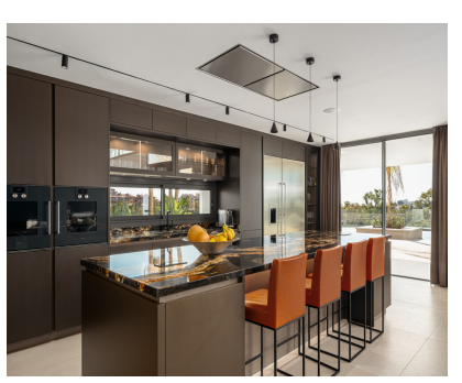
Ref.-ID: R4783567 Benahavís