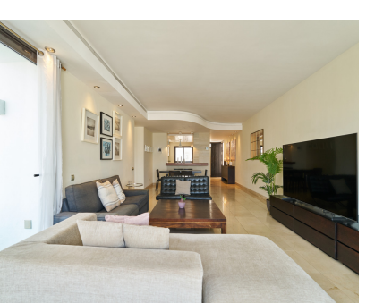
Ref.-ID: R4861162 Marbella Апартамент