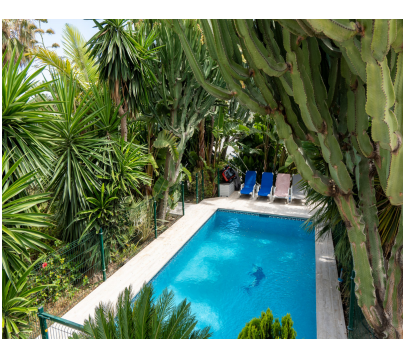
Дом Ref.-ID: R4894558 Marbella