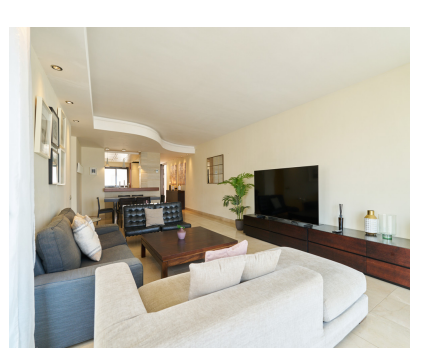
Ref.-ID: R4964593 Marbella Апартамент