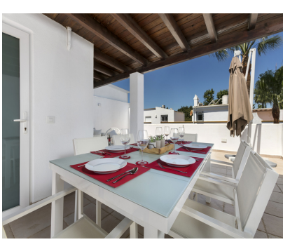
Ref.-ID: R3713126 Marbella Дом