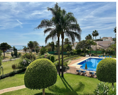
Ref.-ID: R4312840 Elviria Апартамент