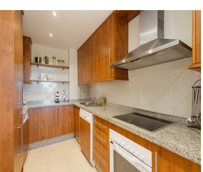
Ref.-ID: R4815208 Elviria Апартамент