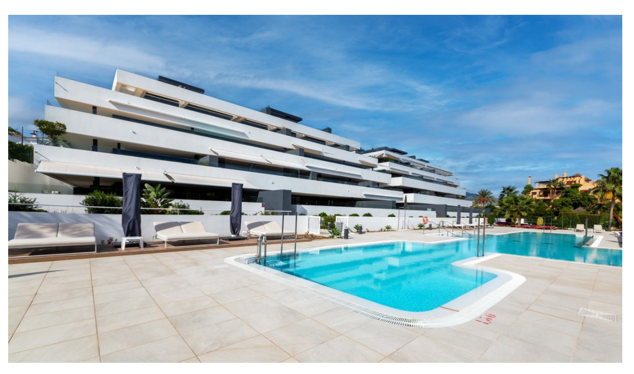
New Golden Mile