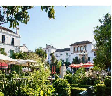
Ref.-ID: R4280731 Marbella Коммерческая