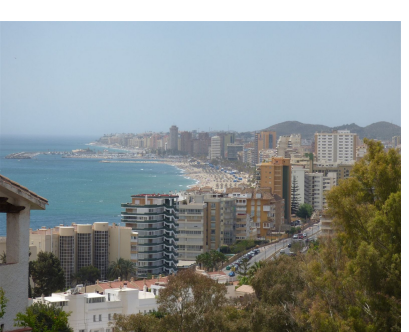
Ref.-ID: R4417372 Fuengirola Коммунальные: 432 EUR /