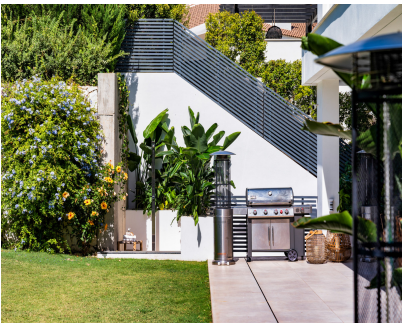
ИБИ: 1,800 EUR / год