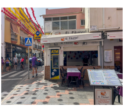
Ref.-ID: R4679032 La Cala de Mijas Коммерческая