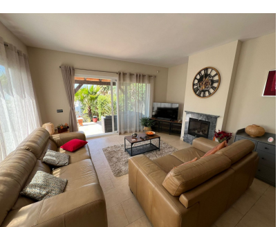
Ref.-ID: R4708960 Benalmadena

Коммунальные: 2,832 EUR / год ИБИ: 920 EUR / год