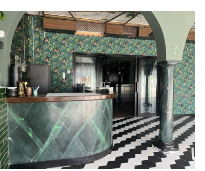
Ref.-ID: R4793293 Elviria Коммерческая