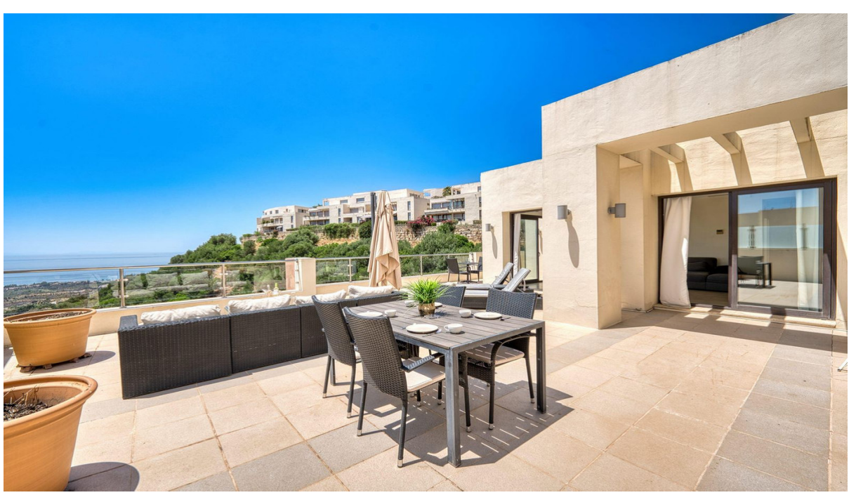
Altos de los Monteros