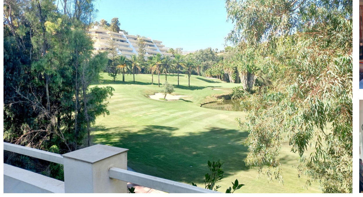
Ref.-ID: R4830526 Benalmadena Costa