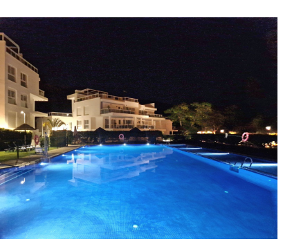
Ref.-ID: R4846927 Benahavís

Коммунальные: 2,880 EUR / год ИБИ: 530 EUR / год