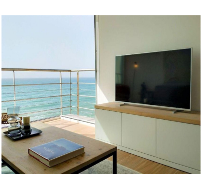
Ref.-ID: R4873873 Benalmadena