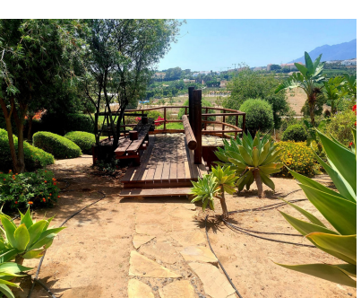
Ref.-ID: R4902700 Cancelada